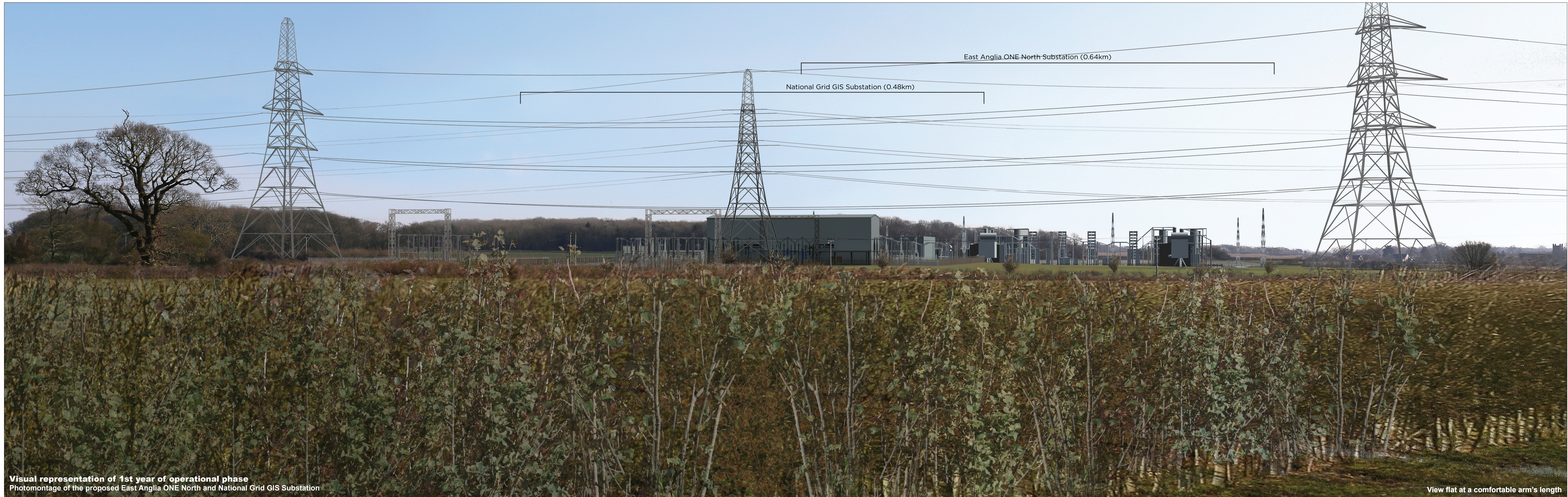
Visual representation of 1st year of operational phase Photomontage of the proposed East Anglia ONE North and National Grid GIS Substation