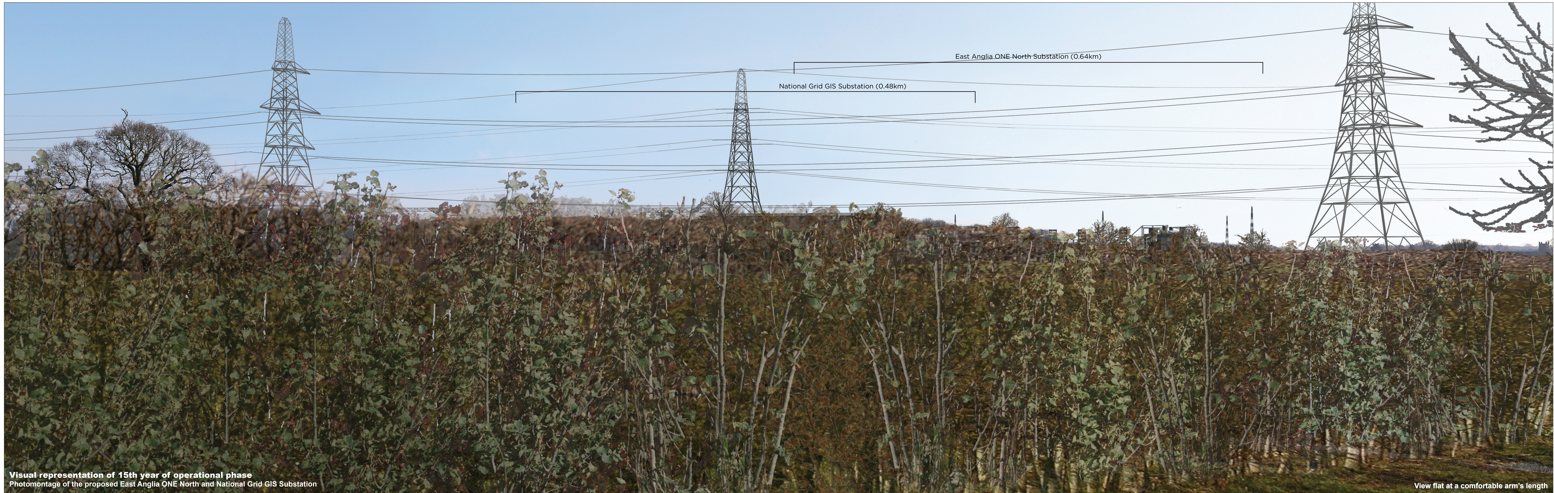
Visual representation of 15th year of operational phase Photomontage of the proposed East Anglia ONE North and National Grid GIS Substation