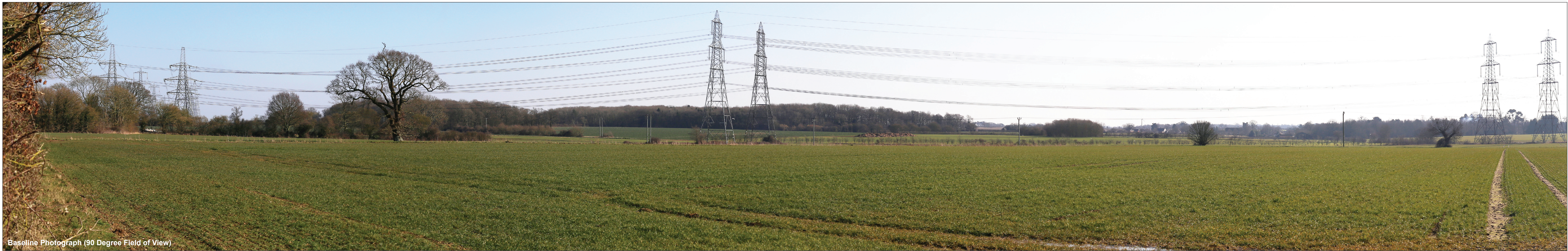
Baseline Photograph (90 Degree Field of View)