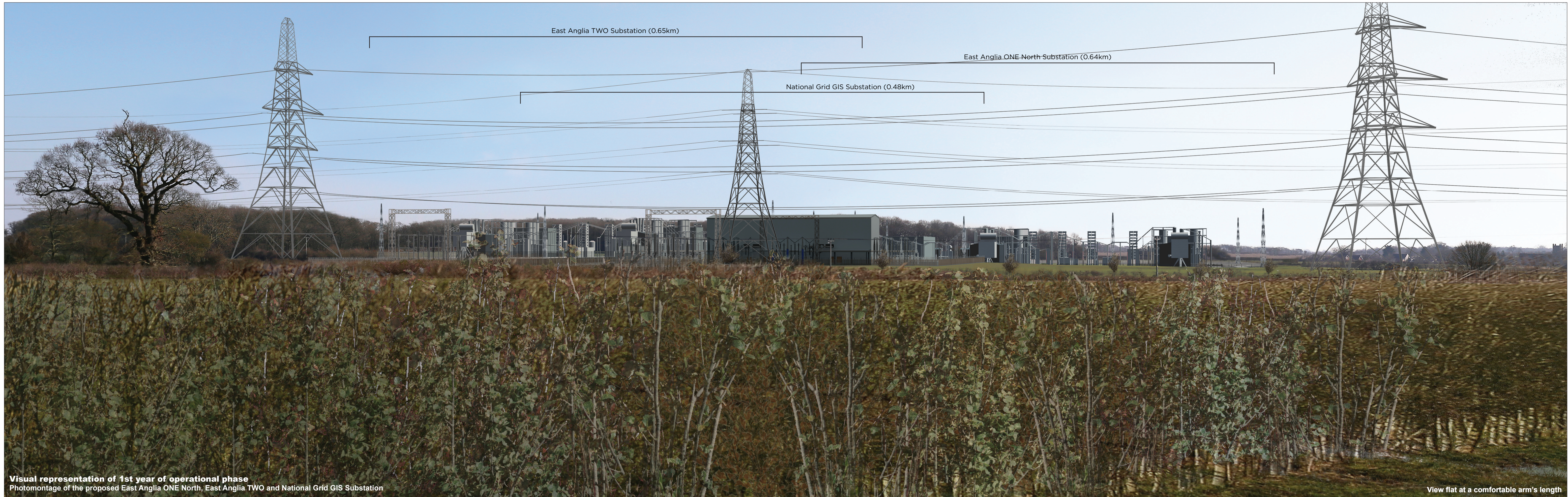
Visual representation of 1st year of operational phase Photomontage of the proposed East Anglia ONE North, East Anglia TWO and National Grid GIS Substation